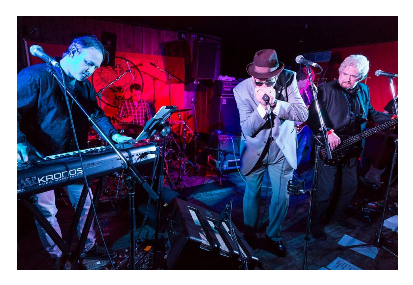
Blues n' Trouble

Some rockin' blues from 'Blues n' Trouble'. It was a shame there was not enough room for dancing in the very hot Club Rock, as that's what you wanted to do with this band! Some great up tempo rockin' boogie. <a href="http://www.bluesntrouble.co.uk/">http://www.bluesntrouble.co.uk/</a>