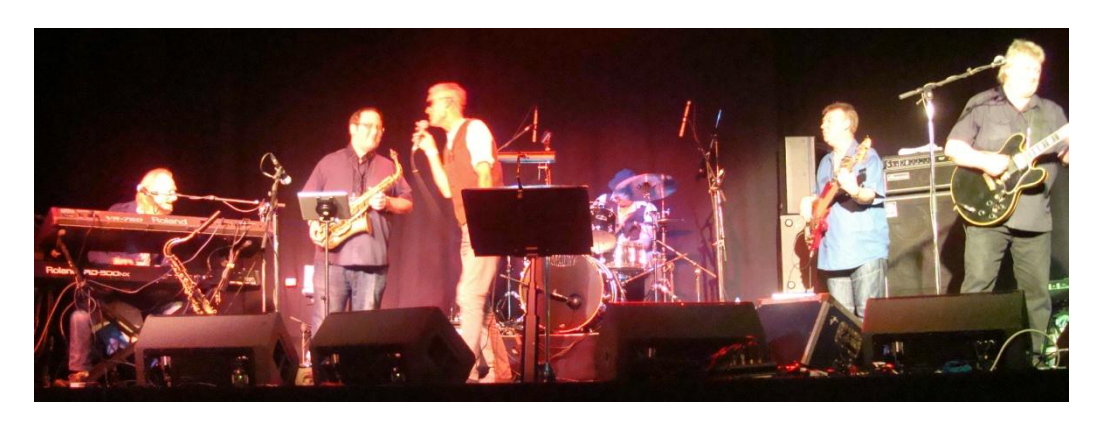
Chicago Blues Band

Enter the veterans of the blues scene! 'The Climax Blues Band' . Changes have taken place over the years, but the very core of the music remains the same. As a six piece they gave a tremendous sound with brilliant blues and blues funk numbers with the all the professional stage presence, that goes with the calibre of this band - magic moments! <a href="http://www.climaxbluesband.com/">http://www.climaxbluesband.com/</a>