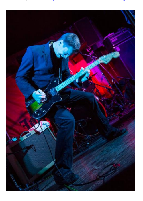
The Mustangs

From Hampshire, the 'Mustangs' brought to the stage some great 'down to earth' harp driven rhythm & blues in their own drivin' style. <a href="http://www.themustangs.co.uk/">http://www.themustangs.co.uk/</a>