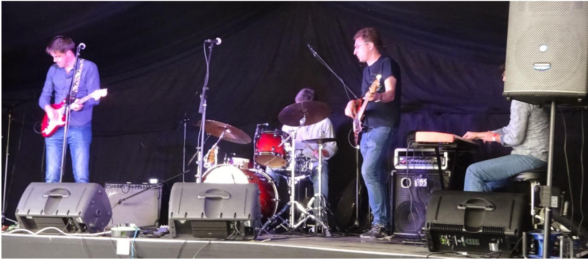
Five Field Holler http://www.fivefieldholler.co.uk/

On the Car Park Stage ' Five Field Holler ' gave a solid performance of funky blues.