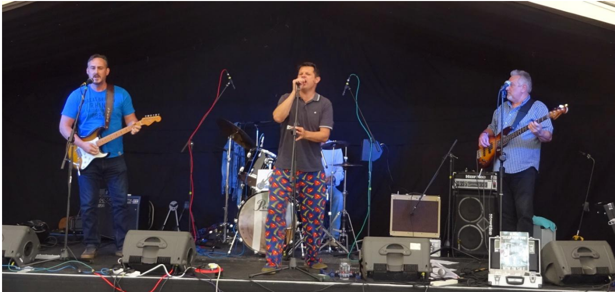
Chicago 9 http://chicago9.webs.com/

Some well put together blues rock from ' Chicago 9 ' on the Garden Stage. With harmonica driven front man and excellent vocals, they were a tight set-up, backed by a well organised bass and drums and proficient guitar player. A great up-tempo sound with a 'Feelgood' flavour.