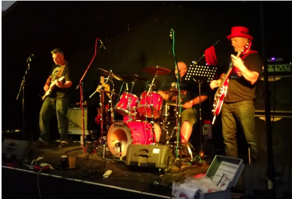
Red House http://www.redhouse3.co.uk/

Back on the Garden Stage some classic R&B in the form of 'Red House' from Bristol. With a dash of rock 'n roll the trio had a great sound with bass and upright bass. Lead vocals came surprisingly from both the drummer and guitarist.