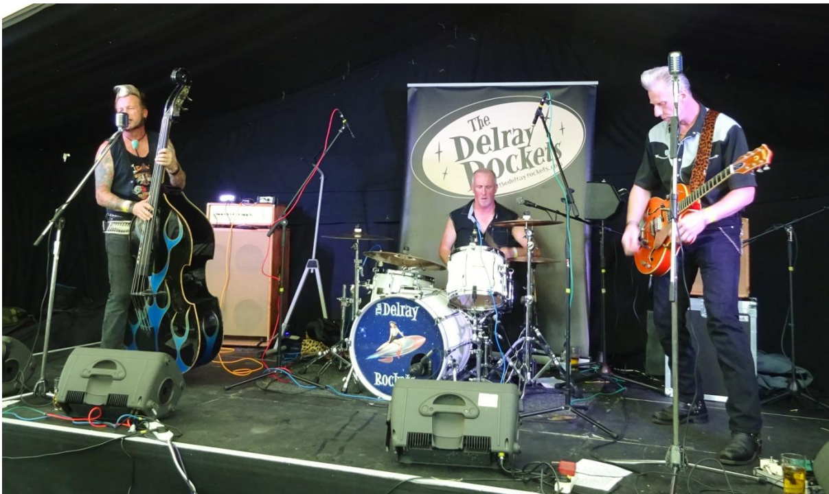
Delray Rockets http://www.thedelrayrockets.com/

Back in the Garden some great 'rockabilly' with The Delray Rockets. In full regalia they gave a lively performance with fabulous upright bass.